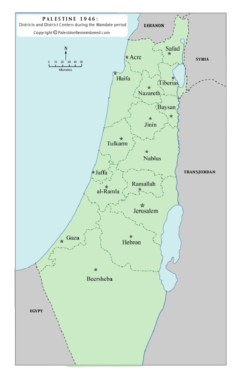
Figure 1.1: Pre-1948 Map of Palestinian districts. Most Palestinians identified with the name of the largest center such as Safad. In Yarmouk Camp streets have been named after these villages and districts. (map provided by PalestineRemembered.com)

1996). Although Palestinian refugees are permitted to take up residence anywhere in Syria many continue to live in designated refugee camps, the largest of which is Yarmouk Camp located outside the capital city of Damascus.