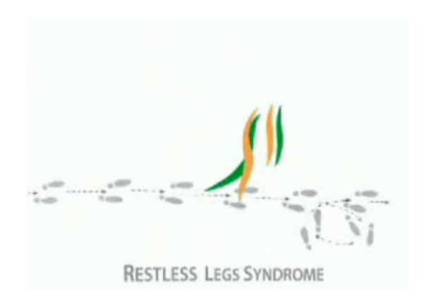
Figure 1: An image taken from a Mirapex commercial posted on Youtube in 2008 exemplifying the tone and representation of those suffering from Restless Legs Syndrome.