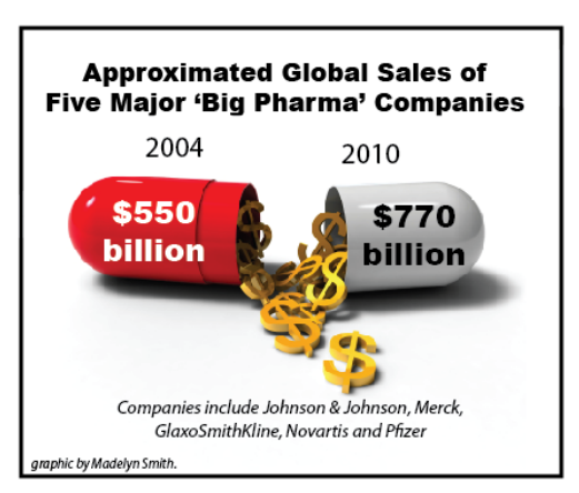
Figure 2: Image by Madelyn Smith. Taken from a blog entry by Madelyn Smith posted May 2, titled: Big Pharma and Consumer Confusion: Are We Overmedicated?

With the growth of pharmaceutical advertisements comes the concern over ethics and the industries' influence on consumers and patients. Gil Roth (2009), editor of Contract Pharma Magazine, named U.S.-established Pfizer Incorporated as the top pharmaceutical company in the world based on its 2008 Pharma revenue of $44.174 billion. Incidentally, Pfizer is also associated with the United States' largest healthcare fraud in the history of the Department of Justice (Harris 2009). In a report from Gardiner Harris of The New York Times, Pfizer pleaded guilty to a criminal violation of the Food, Drug and Cosmetic Act by admitting that it had illegally misbranded and mispromoted four of its drugs. The $2.3 billion settlement is the largest healthcare fraud settlement in U.S. history and one of four Pfizer settlements over illegal marketing activities since 2002.